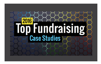
Case Studies: Success stories with proven fundraising techniques.