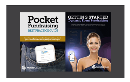
eBooks: Fundraising and donor engagement strategies and guides.