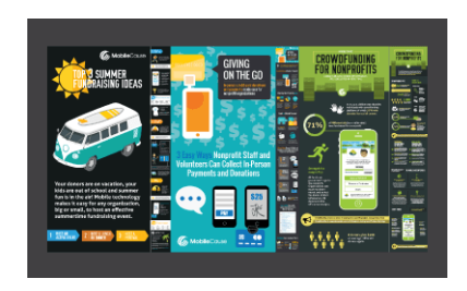
Infographics: Highly visual fundraising best practices to inspire your team.